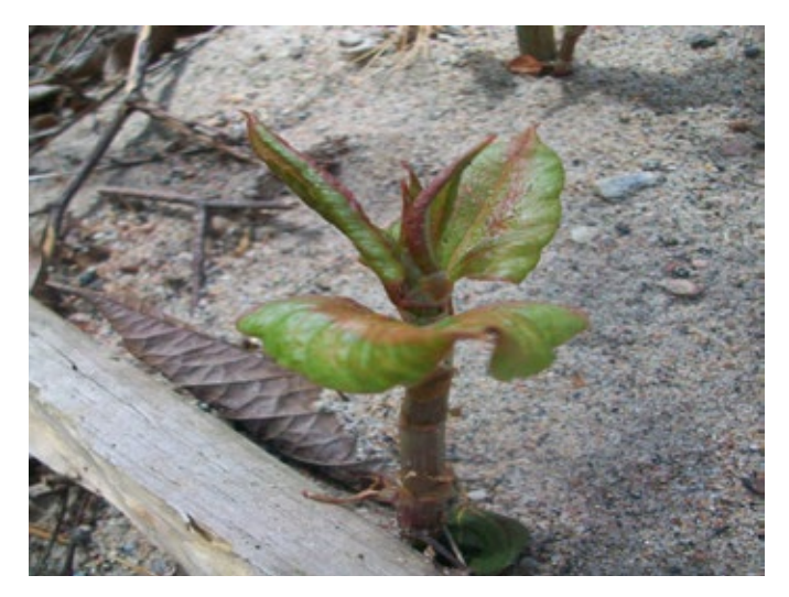
Juvenile stems resemble asparagus and are purplish in colour.