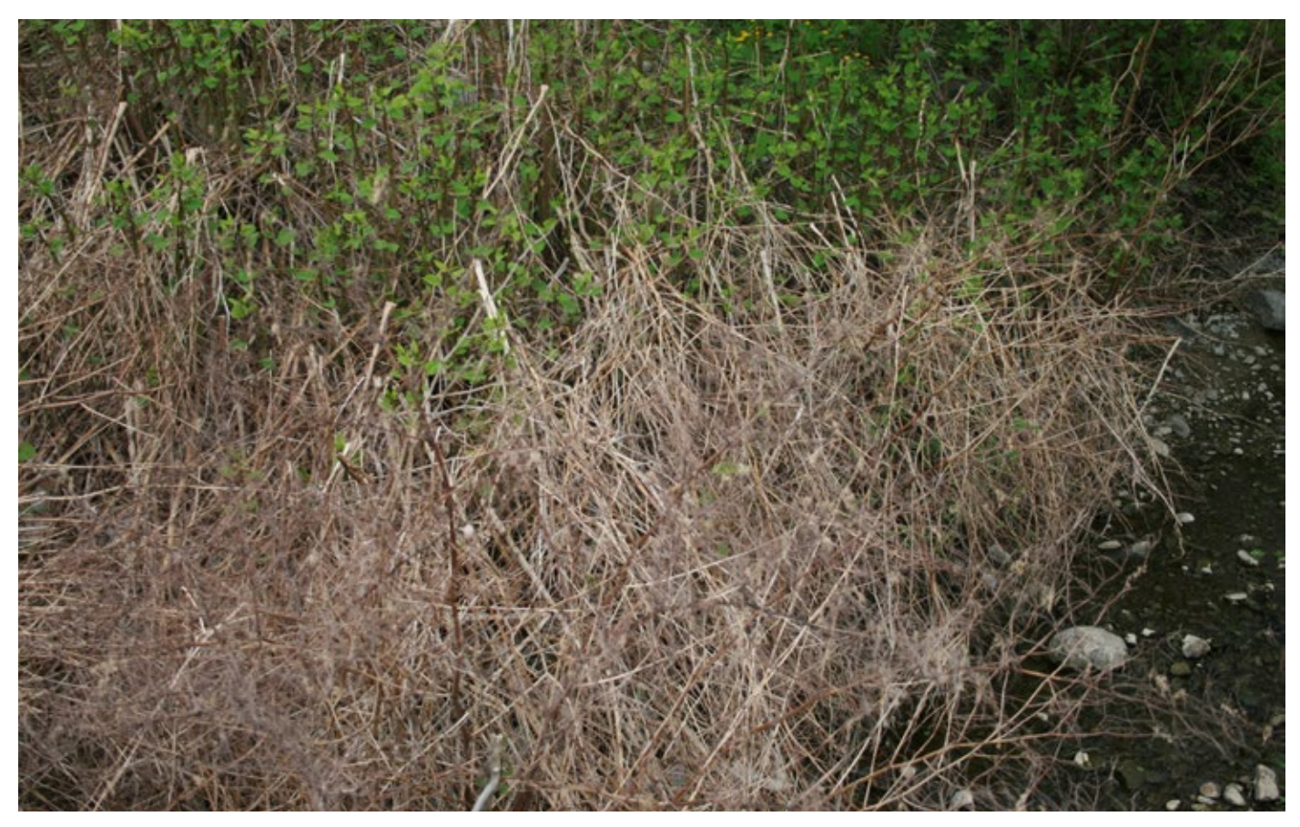
Japanese Knotweed creates thick mats of dead and decaying vegetation.

A municipality can pass a property standards bylaw under the Building Code Act to address the presence of weeds deemed noxious or a threat to the environment or human health and safety. A municipality can also regulate Japanese Knotweed due to concerns for flooding and infrastructure damage.