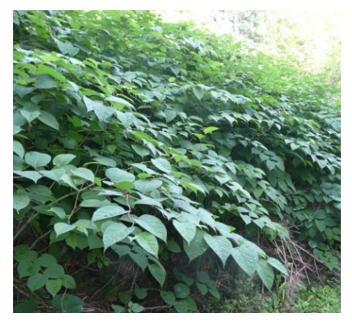
Japanese Knotweed grows in dense stands which can impede access.

Japanese Knotweed can block or interfere with access to water for activities such as canoeing, boating, angling and swimming.