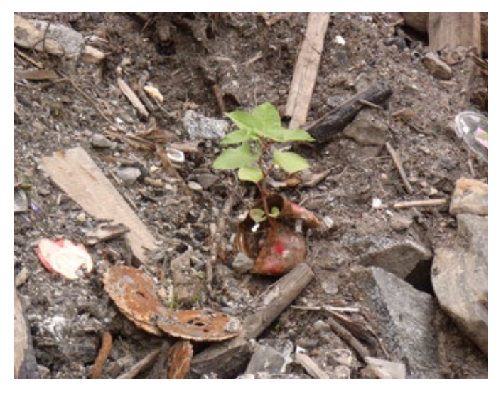
Pieces of the stem or rhizome can produce new plants, as seen in this photo of improperly disposed soil with Knotweed fragments.

Japanese Knotweed quickly develops large underground root systems (rhizomes) which account for two thirds of its total mass. These rhizomes are dark brown, with a bright orange interior. The rhizomes can extend more than 2 m (6 ft) deep and 14-18 m (45-59 ft) in length, and can spread outwards at a rate of about 50 cm/year (19") in optimal conditions. Due to this extensive underground biomass, Japanese Knotweed is a very persistent plant. Pieces of the stem or rhizome as small as 1 cm can produce new plants within 6 days if they are submerged in water. Buried rhizomes can regenerate from depths of up to 1 m, with 2 cm being optimal for regeneration.