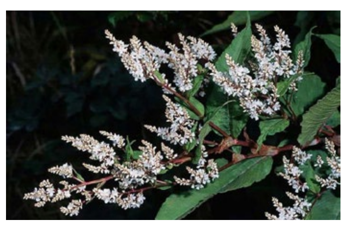
Himalayan Knotweed has no known populations in Ontario.