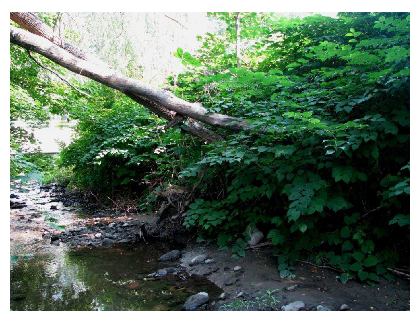
Japanese Knotweed spreads primarily along riparian areas where it can be dispersed by moving water.

Japanese Knotweed grows in a wide range of habitats including riparian areas, wetlands, roadsides, ditches, utility right of ways and fence lines. It is often found around old homesteads where it may have been originally planted as an ornamental. It spreads primarily along riparian areas or ditches where plant and rhizome fragments can be dispersed in moving water (i.e. along canals, beaches, streams and rivers). It can also be spread by moving machinery or equipment with soil containing plant parts (rhizomes). Seeds (if produced) are spread mainly by wind. Japanese Knotweed is available as an ornamental plant in Ontario, and can be spread to new areas from gardens.