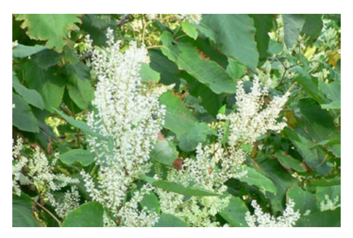
Giant Knotweed has also been introduced to Ontario.

Native to the Himalayan mountain region in Southern Asia. There are no known populations in Ontario; however it has been reported in British Columbia, Nova Scotia and Newfoundland.