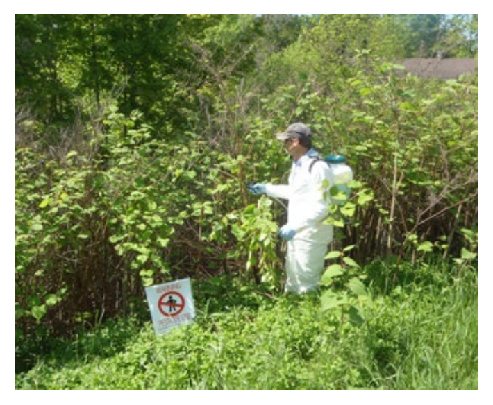
Foliar spray done by Credit Valley Conservation.

Refer to the label of the herbicide you are using for rates and instructions for foliar application.