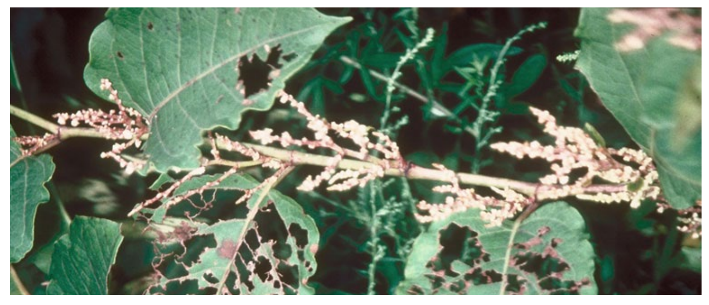
Biological Control agents are being researched.

In its native range, Japanese Knotweed has many predators and pathogens which control its growth. Several of these predators and pathogens have been studied for use as a biological control. In the United Kingdom, two potential biological control agents (a leafspot fungus and a psyllid) have been identified and the psyllid (sap-sucking insect) has been released in quarantine areas for a 5 year field trial. Research is also ongoing in Canada and the United States to determine the feasibility of these biocontrol agents.