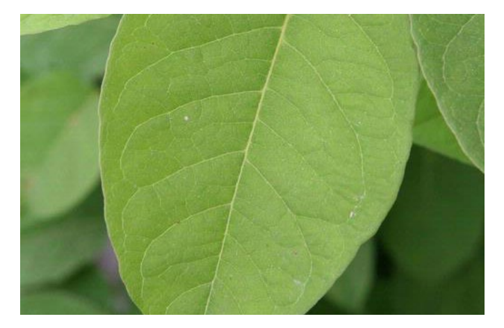
Bohemian Knotweed is a hybrid of Japanese and Giant Knotweed, it is possibly present in Ontario.