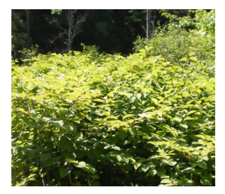
Japanese Knotweed can grow in a variety of site conditions, including full sun.

Japanese Knotweed can grow in disturbed areas.