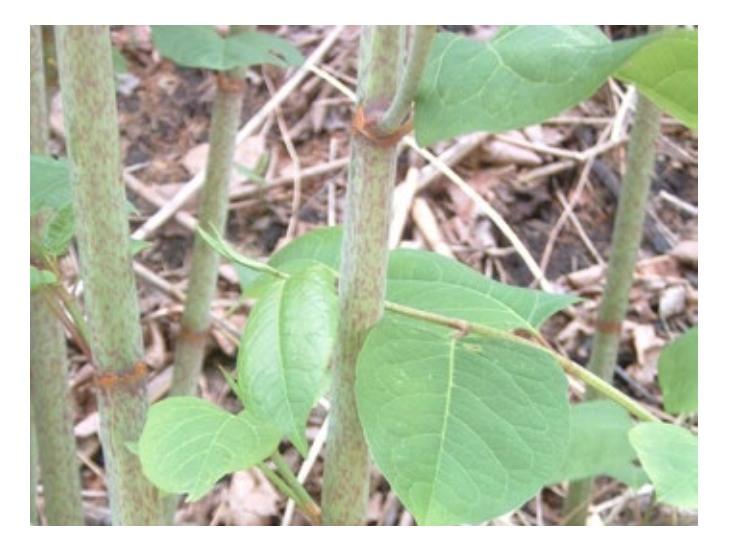
Hollow, jointed stems have reddish brown solid nodes and look similar to bamboo.

Japanese Knotweed has hollow, smooth, purple to green coloured stems up to 2.5cm (1") in diameter. The hollow jointed stems have reddish-brown solid nodes surrounded by a papery sheath (stipule), a trait unique to members of the buckwheat ( Polygonaceae ) family. The stems die back each fall and the dead stalks remain standing over the winter. Numerous new stems emerge in the spring (usually late March – early April in southern Ontario) from the over-wintering root system. The juvenile stems resemble asparagus ( Asparagus officinalis ) spears and are purplish in colour, fading to green as they mature. Japanese Knotweed grows rapidly; stems can grow up to 8 cm (3") per day. The plant can grow 1 m (3.2 ft) in height in three weeks, with the mature plant reaching full height by the end of July. This plant grows in large bamboo-like clumps, reaching heights of 1-3 m (3-10 ft).