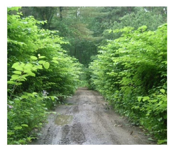
Roads are one of the main geographic pathways for spread within Ontario.