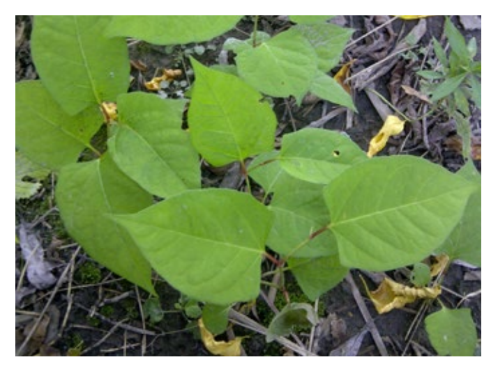
Leaves have a flat base and pointed tip.