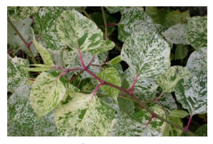
Japanese Knotweed 'Variegata' is a horticultural cultivar.