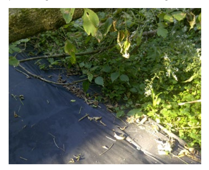
Tarping done by Credit Valley Conservation.

The tarp will need to be left in place for more than one growing season (up to 3 growing seasons) to ensure effective control. This method is very labour intensive. Monitor for plants growing from under the edges of the tarp (or through the tarp). Monitor rips/tears in the tarp as plants will continue to grow if there are rips/tears or any access to sunlight/air. This method may need to be done in conjunction with another method to ensure the entire patch is controlled. Since tarping essentially "cooks" the soil, mycorrhizae (beneficial soil fungi) may need to be added when re-planting. Re-planting the area with native vegetation once control measures are complete will help to suppress re-sprouting and assist in preventing new invaders from establishing.