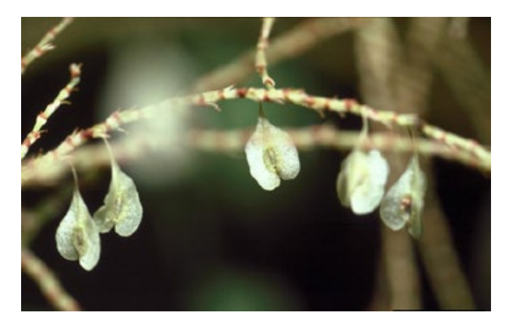
Fruit is winged, which helps in seed dispersal.