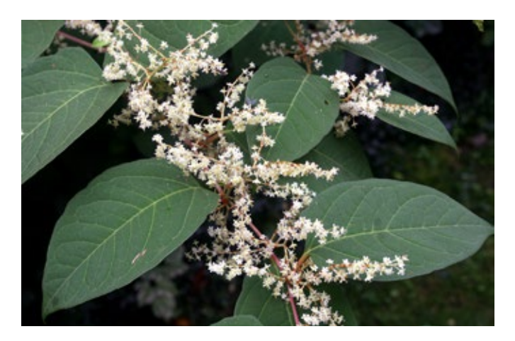
Japanese Knotweed has small, white-green flowers that bloom in sprays.

There are several horticultural varieties (cultivars) of Japanese Knotweed, which may have different characteristics based on their breeding. These include: 'Crimson Beauty' which has dark red flowers, 'Variegata', which has variegated leaves (leaves are multi-coloured or are edged in white), and 'Compactum' or Dwarf Japanese Knotweed which has been bred to grow smaller (up to 1 m in height). These cultivars can also be invasive. If they are pollinated by Japanese, Bohemian or Giant Knotweed populations they can produce seeds and will also reproduce vegetatively.