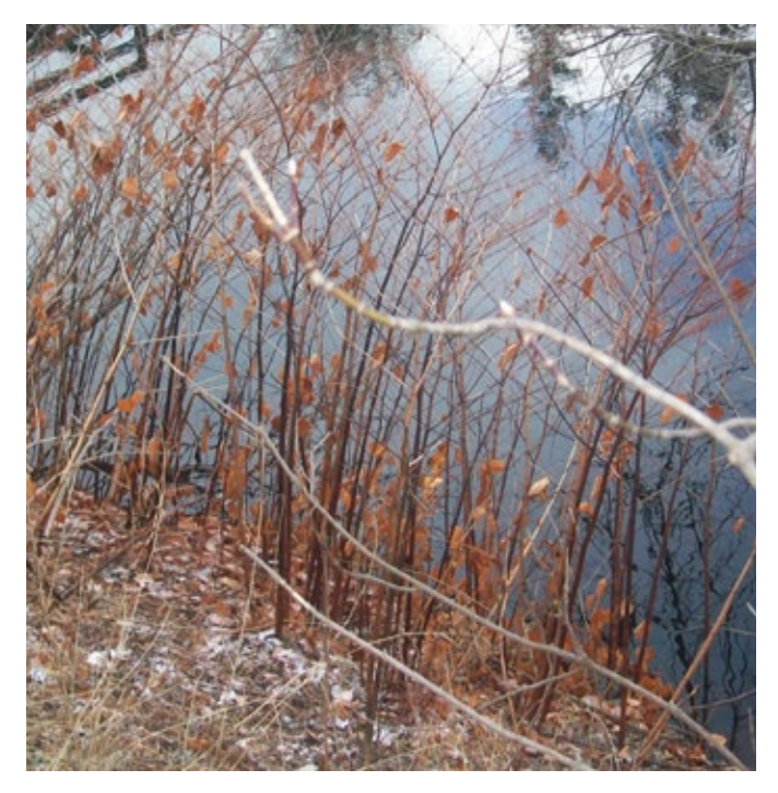
Stalks die back each fall and remain standing.