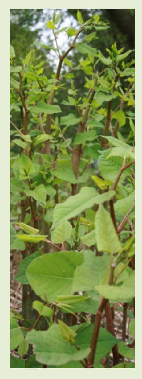
Japanese Knotweed.