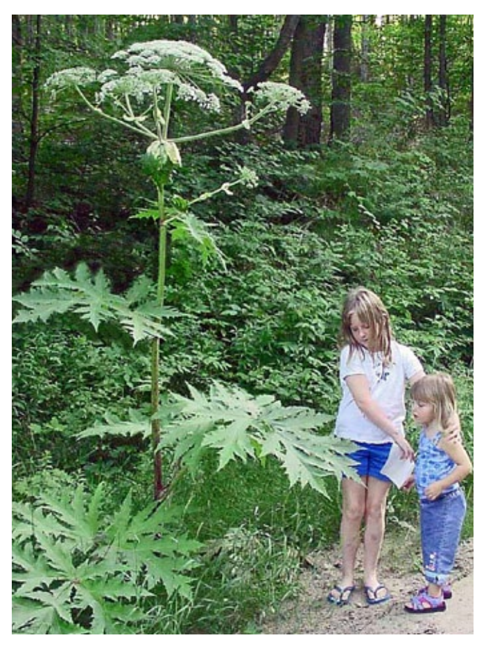
It is important to get to know this plant – and its "look-alikes"

Although all four species have been found throughout Europe, a comprehensive study of the identity of Giant Hogweeds in Canada has not been done. There are no confirmed sightings of H. persicum or H. sosnowski in Canada and reports of H. sphondylium are rare, but that may be simply because it's difficult to distinguish between these species. For simplicity, this document will assume that all Giant Hogweeds occurring within the province are H. mantegazzianum .