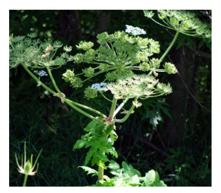
Giant Hogweed should be controlled before seeds are produced.

Mechanical control is most effective if done in early spring (ie. late April to early May). The overall success of mechanical control options depends on the size of the Giant Hogweed population. Mechanical control works best when dealing with a limited number of plants in relatively accessible locations. Due to the close contact with the plant required for these options, extreme care must be taken to ensure workers' health and safety. Note: Motorized tools such as "whipper snippers" should never be used for control of Giant Hogweed or other plants with phototoxic properties as the sap can be splashed on to the operator.