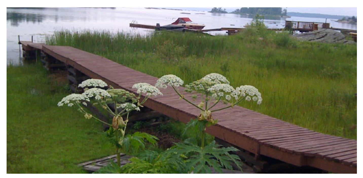
Giant Hogweed frequently grows near water.