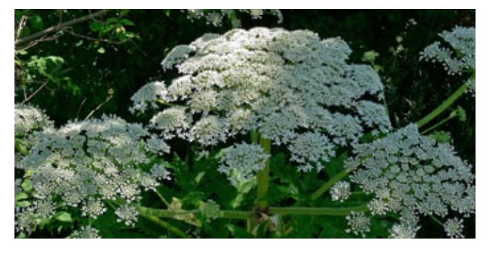
Tiny flowers in umbels.

Whitish flowers appear in mid-June and are clustered in umbel shaped heads which can measure up to 1m across. Umbels are an umbrella-shaped cluster of short-stalked flowers, typical of plants of the carrot family. Each compound umbel can have 50-150 rays which can lead to a single plant producing well over 50,000 flowers. The green fruit (seeds) produced by each flower dry out and turn brown in the late summer. They need to undergo 2-3 months of cold in order to break their dormancy and begin to sprout. Giant Hogweed is a monocarpic plant which means that it flowers once and then dies.