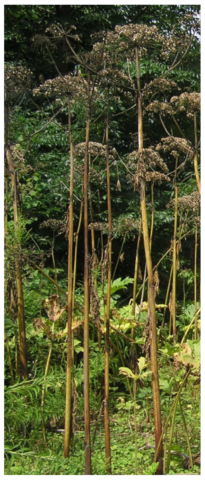
Giant Hogweed after chemical control.

It is recommended that areas treated with glyphosate are covered in mulch 10-14 days after application to manage seedling germination. Herbicide treatments need to be repeated annually. If a plant is flowering, herbicides are not effective and control methods should focus on carefully removing the flower heads as per the instructions under 'Flower Removal' (above).