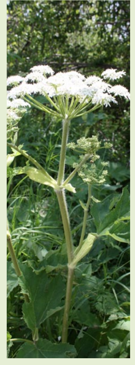
Giant Hogweed.