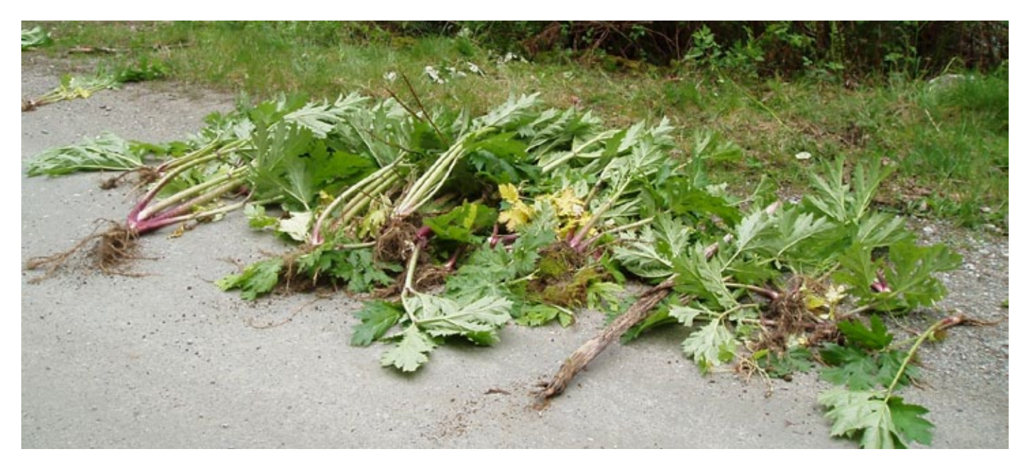
Removed plants lying on road

In addition, H. sosnowski and Wild Parsnip ( Pastinacasativa ) are proposed for addition to the WSO, as a Class 2- Primary Noxious weed and Class 3-Secondary Noxious weed respectively.