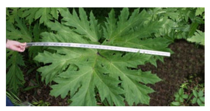
Mature leaf – this one a metre wide.