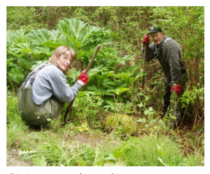
Digging to remove hogweed.

Use a spade to remove as much of the taproot as possible. Unless the entire root is removed, it is possible that the plant will re-grow and repeated digging or covering the dug area with black plastic to smother new growth will be necessary.