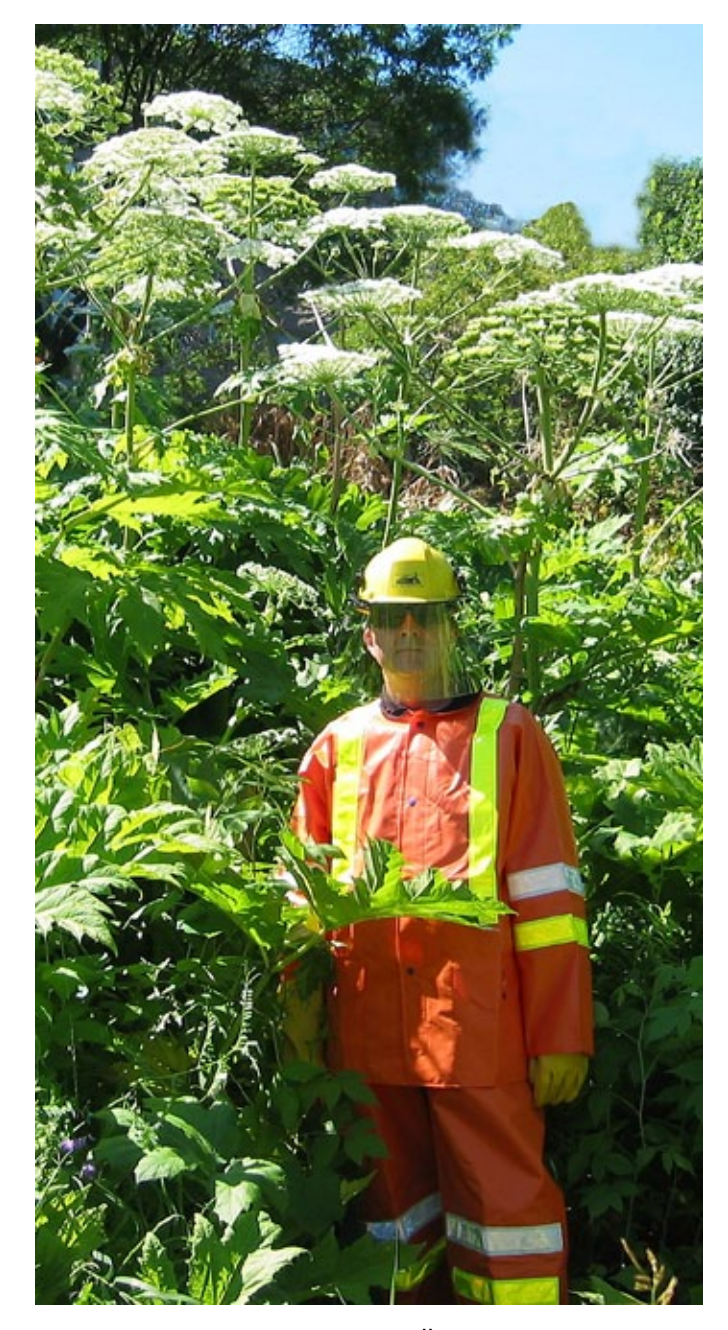
It can grow to over 5 metres tall.

Giant Hogweed is a perennial herb which can grow to 5.5m under ideal conditions, though such sizes are rarely seen. Typically the plant reaches heights of 3-4.5m across Ontario although that varies based on soil and habitat type.