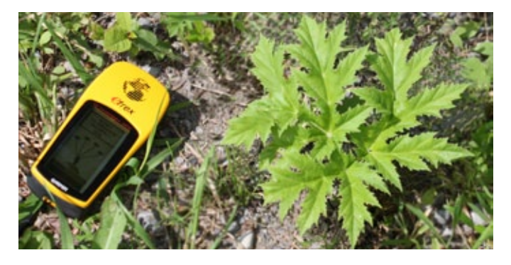
Seedling leaf.

Leaves are prominently spiked with a pronounced jagged appearance. On mature plants, leaves are divided into three equal or almost equal parts which are then divided into a further 3 parts (ternate). Smaller plants may just be deeply lobed. Leaves can grow up to 1m wide.