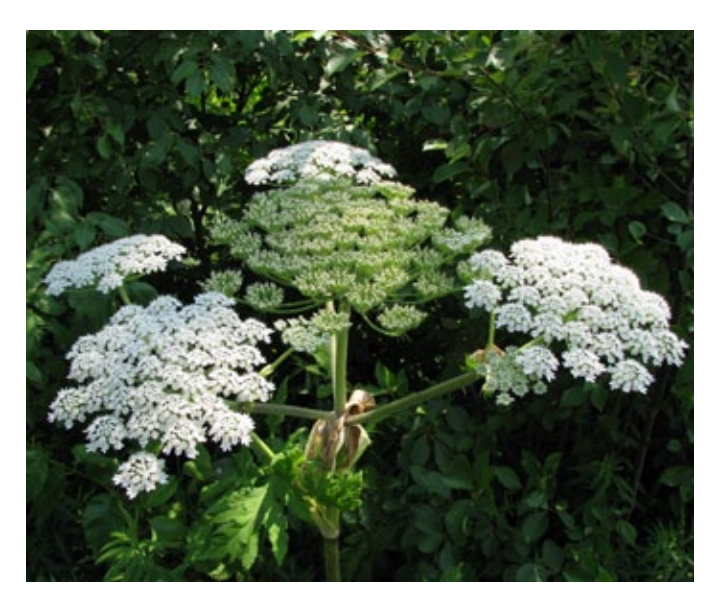
Umbels turn green as seed develops.

This method should only be considered as an improvised solution for control of stands where no other attempts of control have taken place earlier in the season.