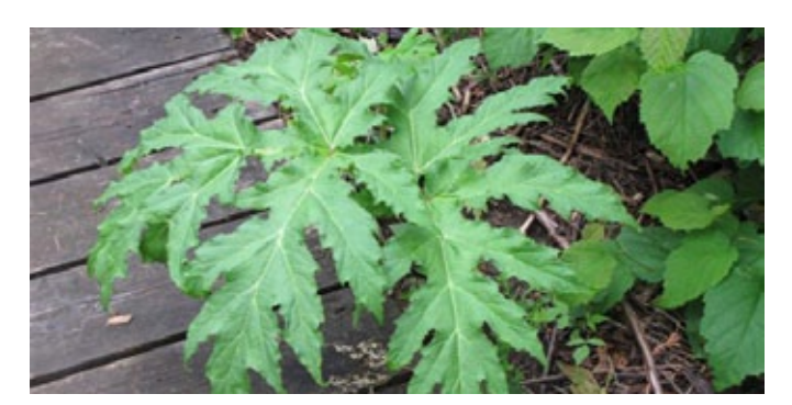
Mature leaf.