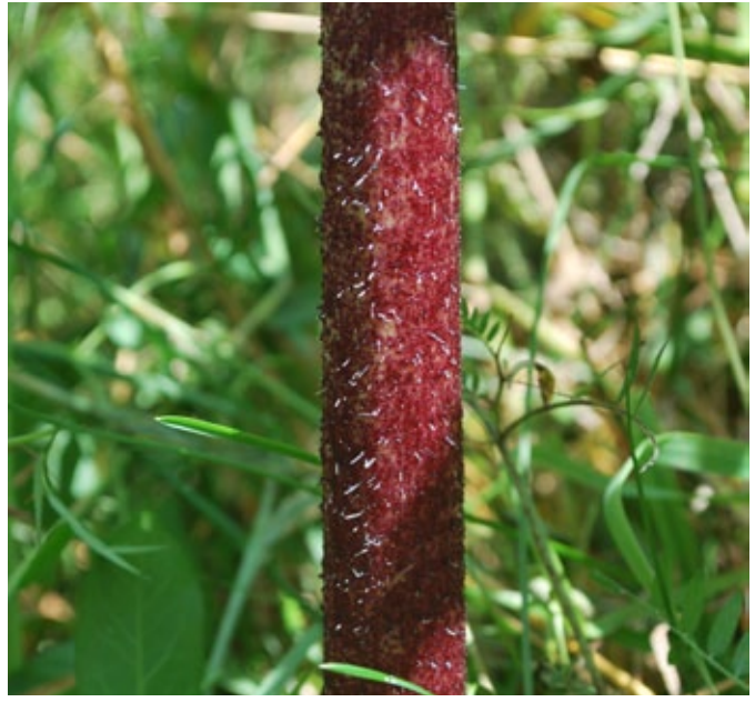
The bristles and purple blotches on the stem are distinctive.