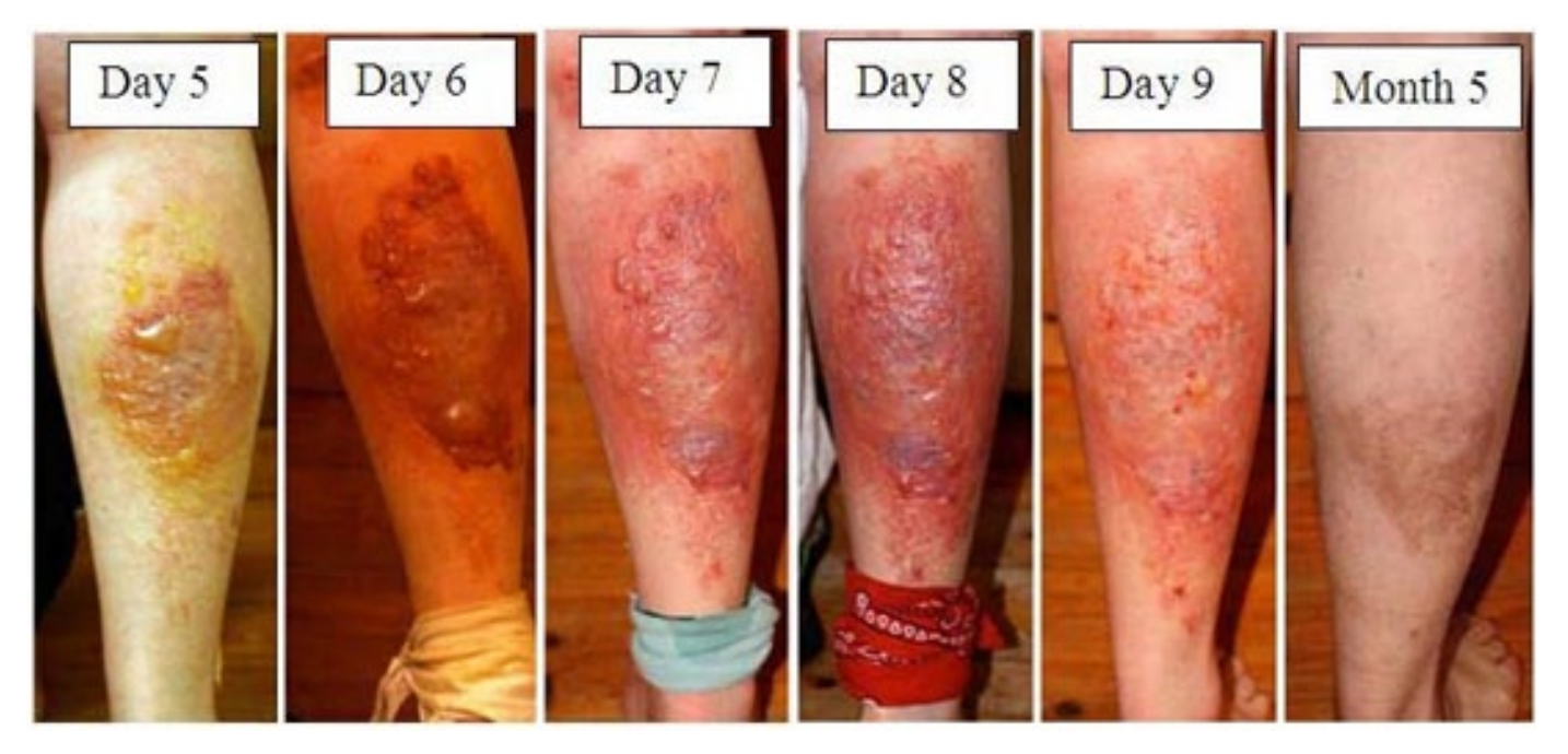
Burn to leg caused by Giant Hogweed sap - 5 days to 5 months after initial exposure

Giant Hogweed contains a phototoxic sap which reacts with ultra-violet (UV) light once it has come in contact with the skin. It can cause 2nd degree burns. The organic chemicals called furanocoumarins that cause the burns also deter predators from eating the plant. Other plants with similar phototoxic properties include Wild Parsnip ( Pastinaca sativa ) and Cow Parsnip ( Heracleum maximum ).