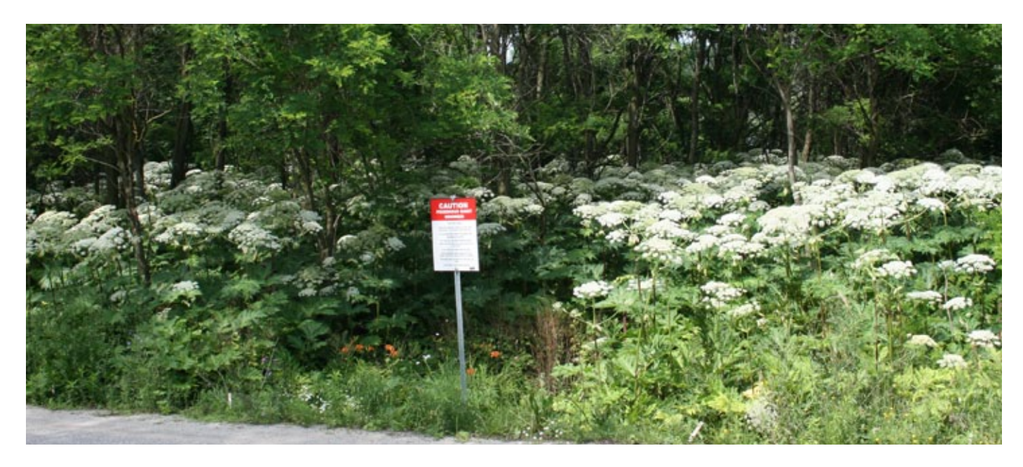
Giant Hogweed is found in many locations across Ontario.

The extensive distribution of Giant Hogweed in southern Ontario requires a coordinated and focused response to control and management. To facilitate this, the province has committed to develop and share these Best Management Practices.