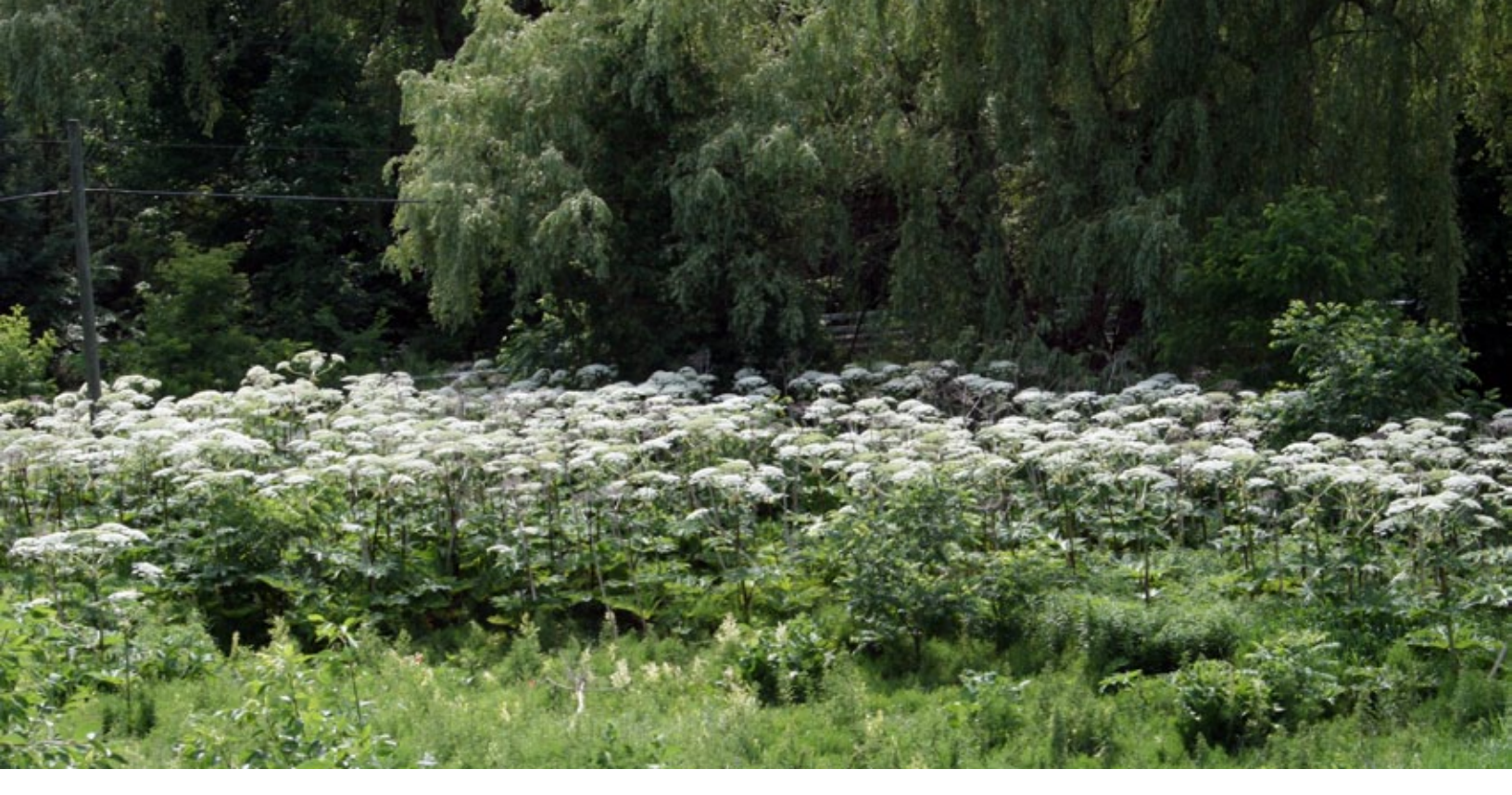
Giant Hogweed escaped from gardens.