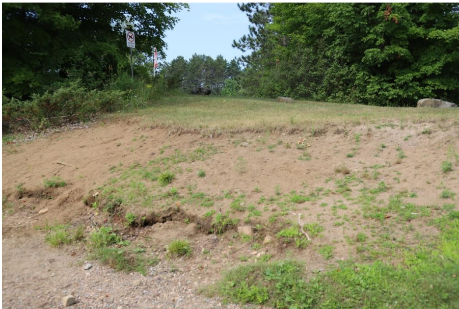
Figure 2.0 – Current Beach Area – Taken from shoreline looking at southern extent