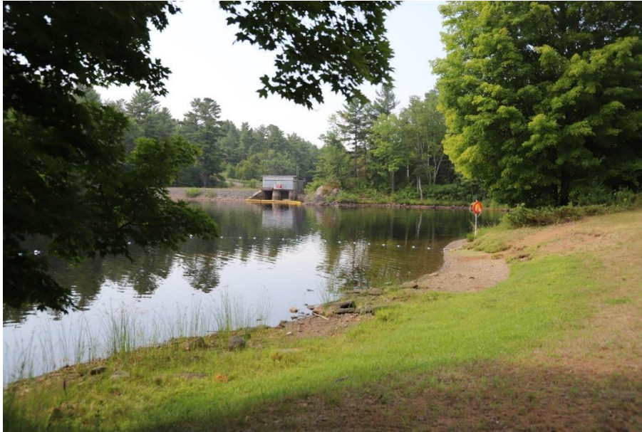
Figure 1.0 – Current Beach Area – Shoreline