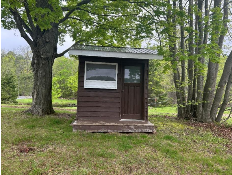
Figure 3.0 – Current Changeroom and Surrounding Area