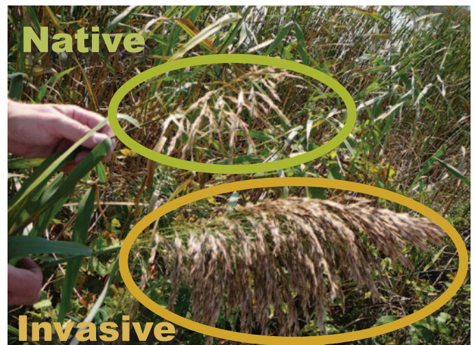
Figure 4: A native Phragmites seedhead (top) and an invasive Phragmites seedhead (bottom). Note that the native Phragmites seedhead is smaller and sparser compared to that of the invasive Phragmites .

Invasive Phragmites stems are generally tan or beige in colour with blue-green leaves and large, dense seedheads, in contrast to the reddish-brown stems, yellow-green leaves, and smaller, sparser seedheads of native Phragmites (Figure 2, 3, and 4). Cross-breeding between invasive and native Phragmites plants has not been confirmed in the field, but has been produced in laboratory studies. Where the plant is found in certain environmental conditions such as those that occur along sandy coastal shorelines and deep water systems, the morphological differences described above are not definitive. If it is not clear whether a Phragmites plant is invasive or native, it is recommended that a Phragmites expert be consulted.