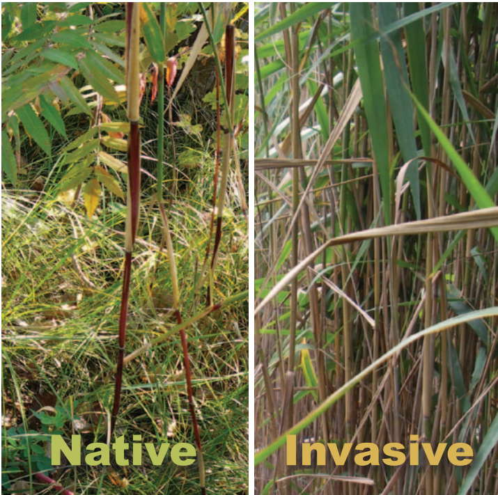
Figure 2: A native Phragmites stem (left) and an invasive Phragmites stem (right). Note the reddish brown native stem on the left, and the tan/beige invasive stem on the right.